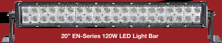
20" EN-Series 120W LED Light Bar

Engo LED light bars provide superior illumination for your needs. Whether it be for your Off-Road vehicle, Marine application, or any heavy machinery equipment where increased lighting is needed. Engo LED light bars will help improve your nighttime conditions for increased productivity and better safety.