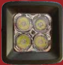
20 Watt LED Light Pair with Harness