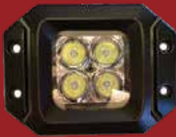
20 Watt LED Light Pair(Flange Mount) with Spot pattern