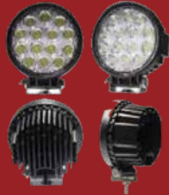
42 Watt Round (Spot) LED Work Light